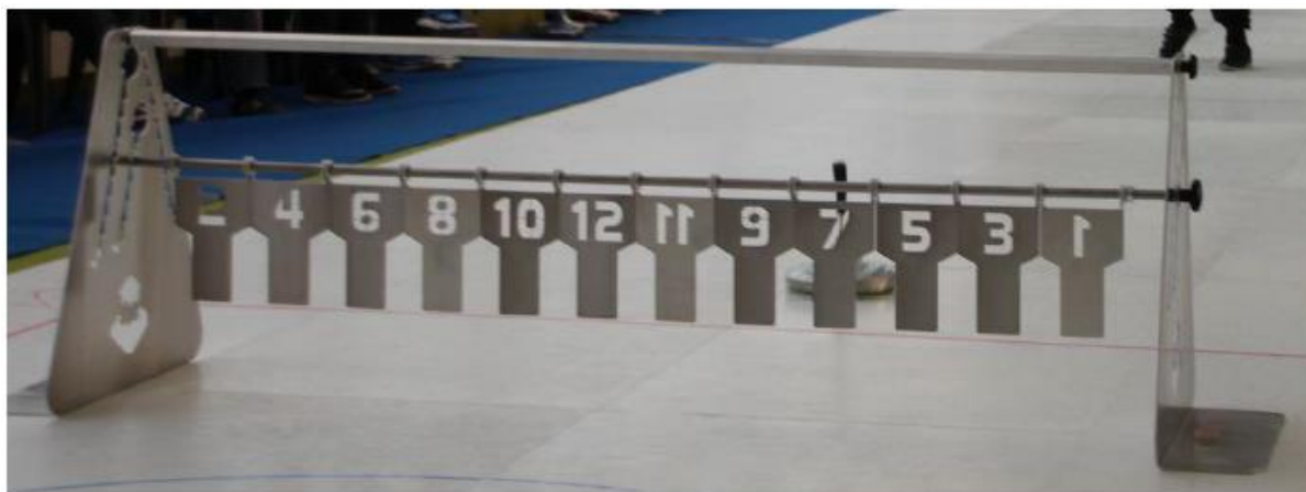
Fig.2. batten frame with scoring points); SOD rules 2022